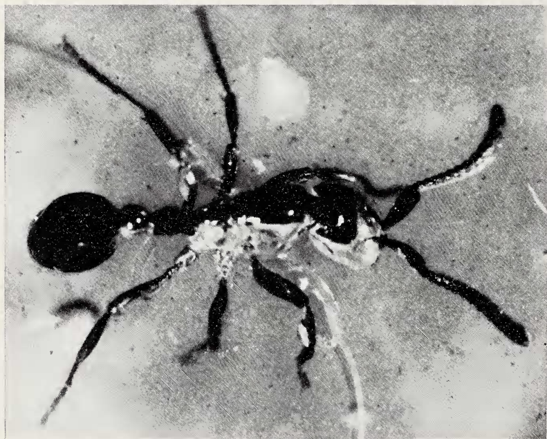
Fig. 2. N. ectopus n. sp. paratype worker: view of entire body.